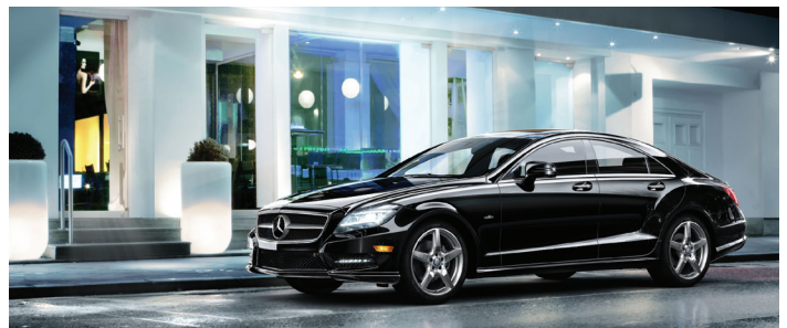
Quickly create stunning photorealistic renderings using 3ds Max and NVIDIA GPUs.

Fueled by NVIDIA's most powerful GPU architecture ever, this solution lets you render more than 12x faster using NVIDIA Multi-GPU Technology while still working with all your other software applications. Now Iray Server distributed rendering software is available from NVIDIA to harness the power of networked workstations for even faster rendering. This helps reduce, or even in some cases eliminate, creation of expensive and time-consuming physical prototypes and photo shoots.