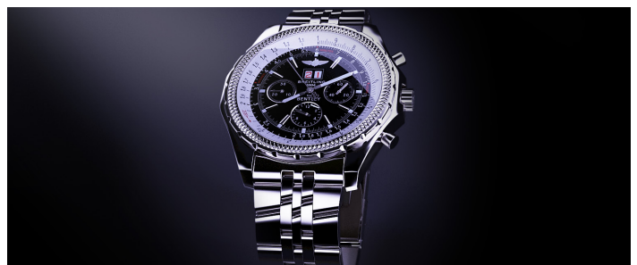
With NVIDIA Iray in 3ds Max designers can interactively see photorealistic representations of their designs.